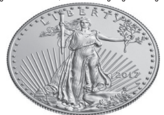
call for quotes on gold and silver